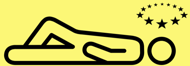
Loss of consciousness