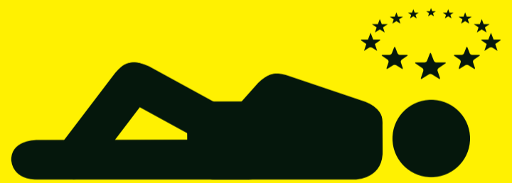
LOSS OF CONSCIOUSNESS